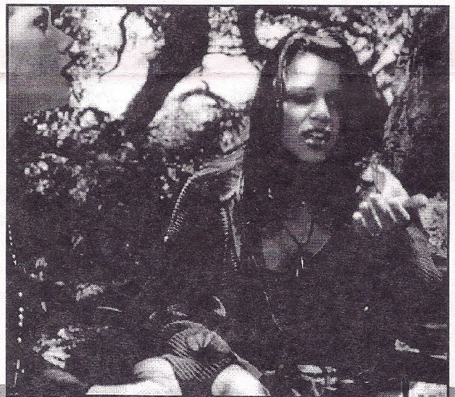
A scene from Columbia Pictures' THE CRAFT.